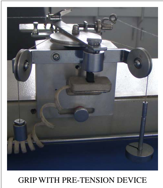
GRIP WITH PRE-TENSION DEVICE